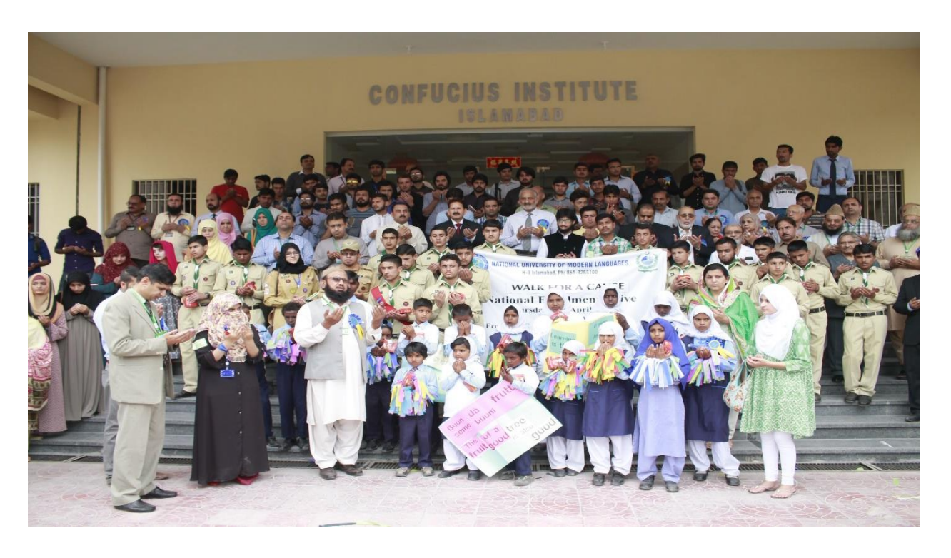
A walk for a Cause (for Education)