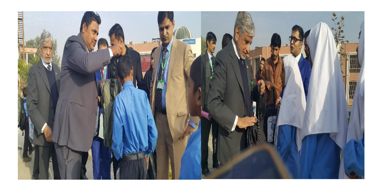
Bags Distribution Ceremony by the Department of Governance and Public Policy