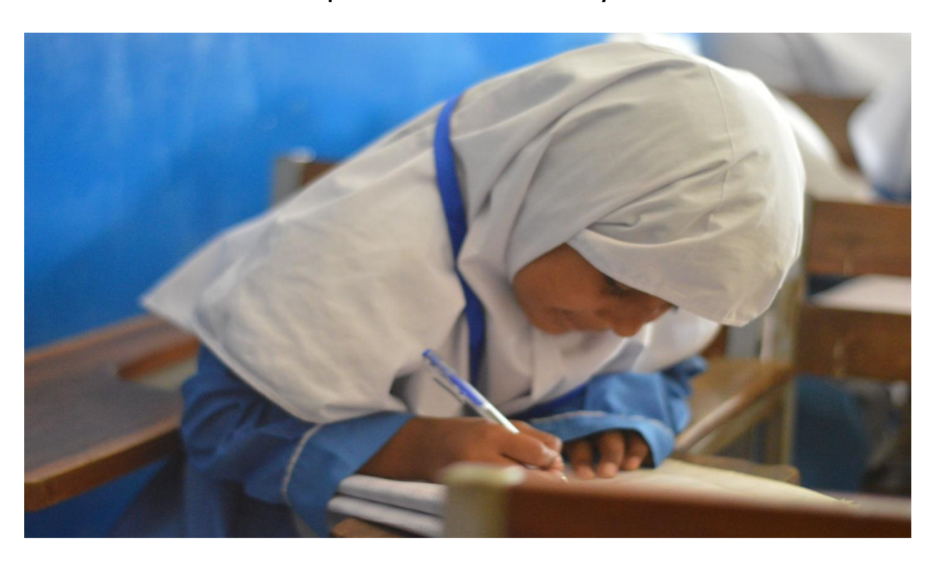
ANNEXURE- E An article published on Zulaikha in Daily Times