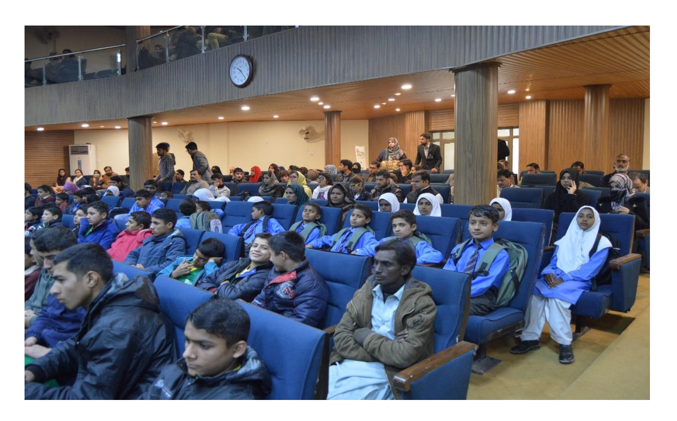
Attending a Seminar on APS Shohada in the NUML Auditorium