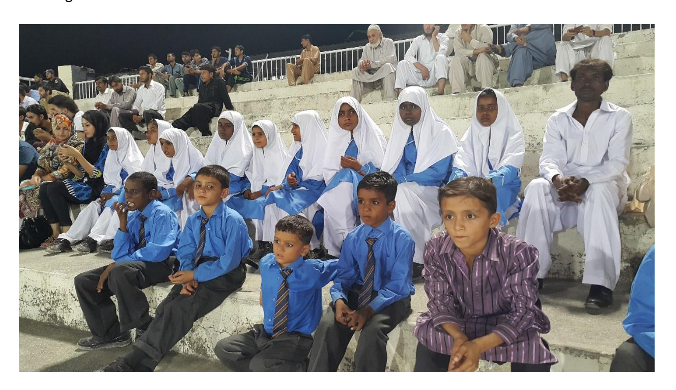
Visit to Rawalpindi Cricket Stadium

National University of Modern Language Islamabad arranged many events for their better learning time to time. The detail is as under