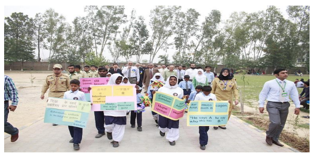
A walk for a Cause (for Education)