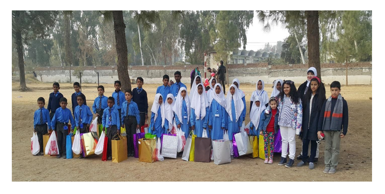
A group photo with Palestine's Diplomat and the Principal of Sheikh Zaid International Academy

The wife of Palestine's Diplomat and the Principal of Sheikh Zaid International Academy visited NUML with her son and daughters to confer their heart by giving them stationery, water bottles, warm coats, Lunch and promise to help them in future.